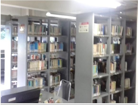
Figure 2. Book selves (inside view)