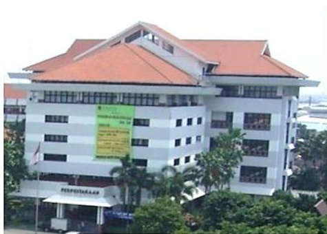
Figure 1. Library building of University of Surabaya

Inside of the building is divided into several partitions for different purposes, such as bookshelves, reading rooms, computer rooms, offices, bathrooms, etc. Figure 2 show typical situation inside of the building. The building uses a